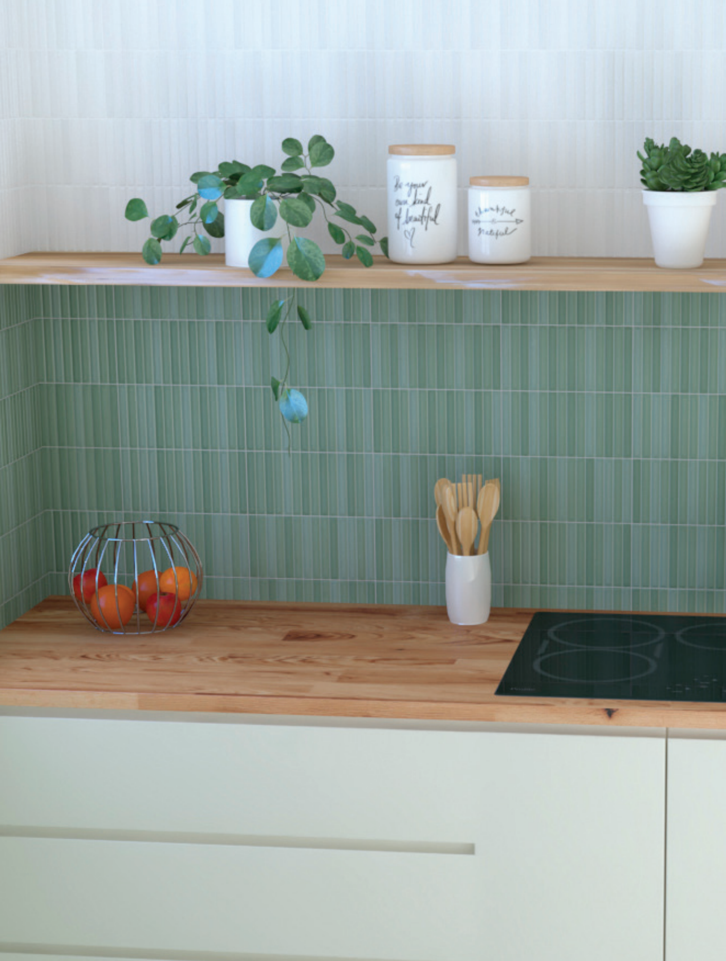
4.5" x 9" Wall Tile in White | Green