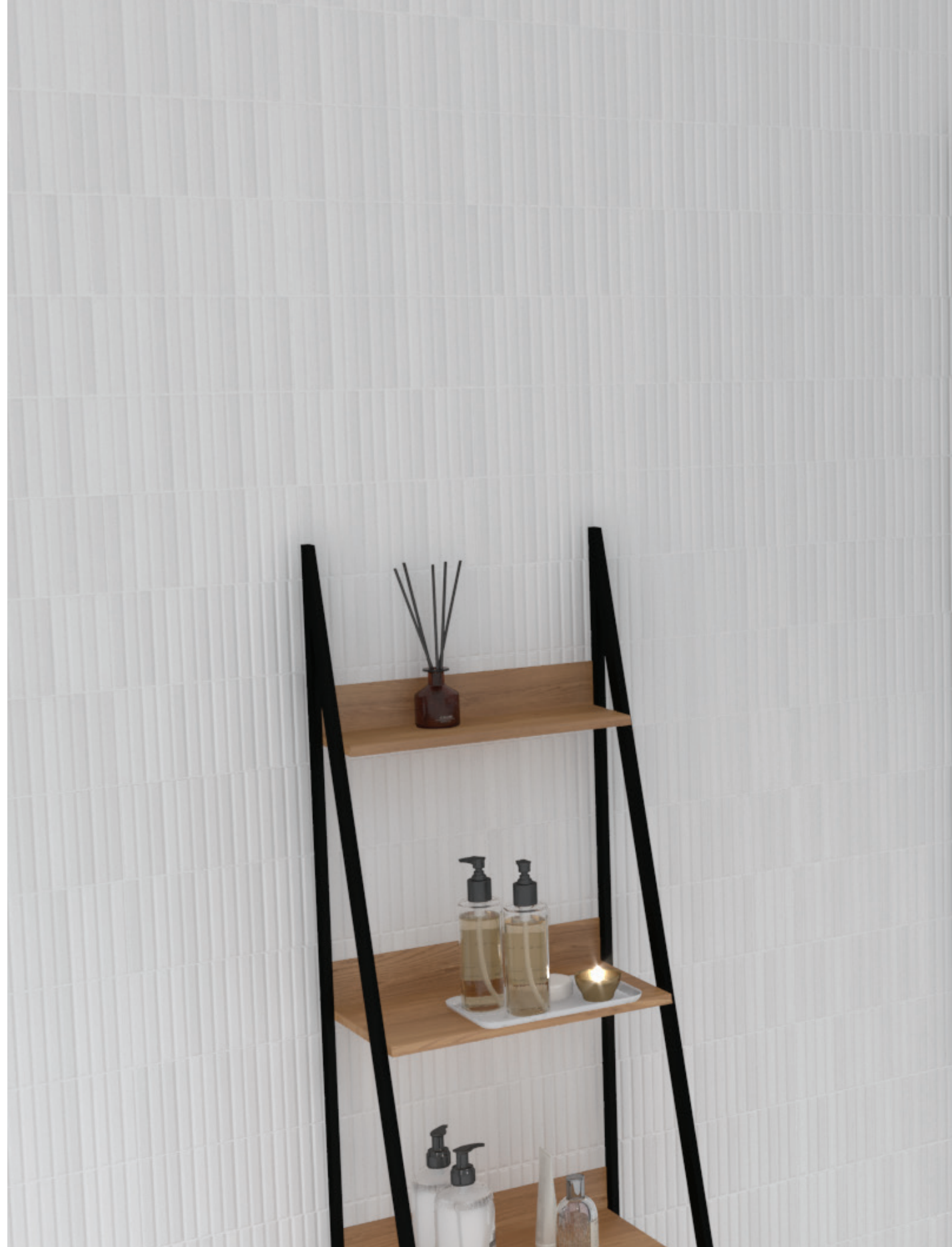
4.5" x 9" Wall Tile in White