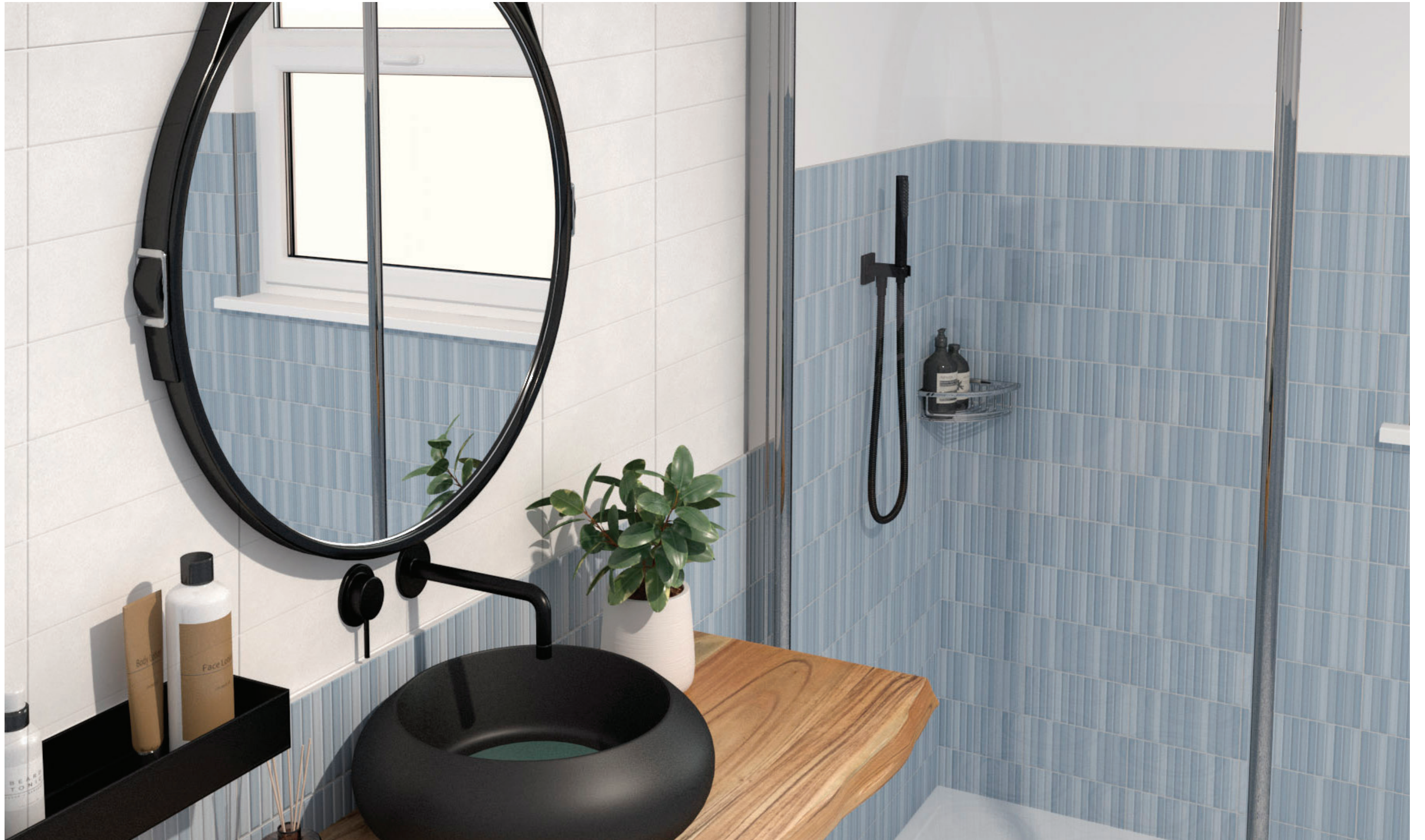
4.5" x 9" Wall Tile in Blue