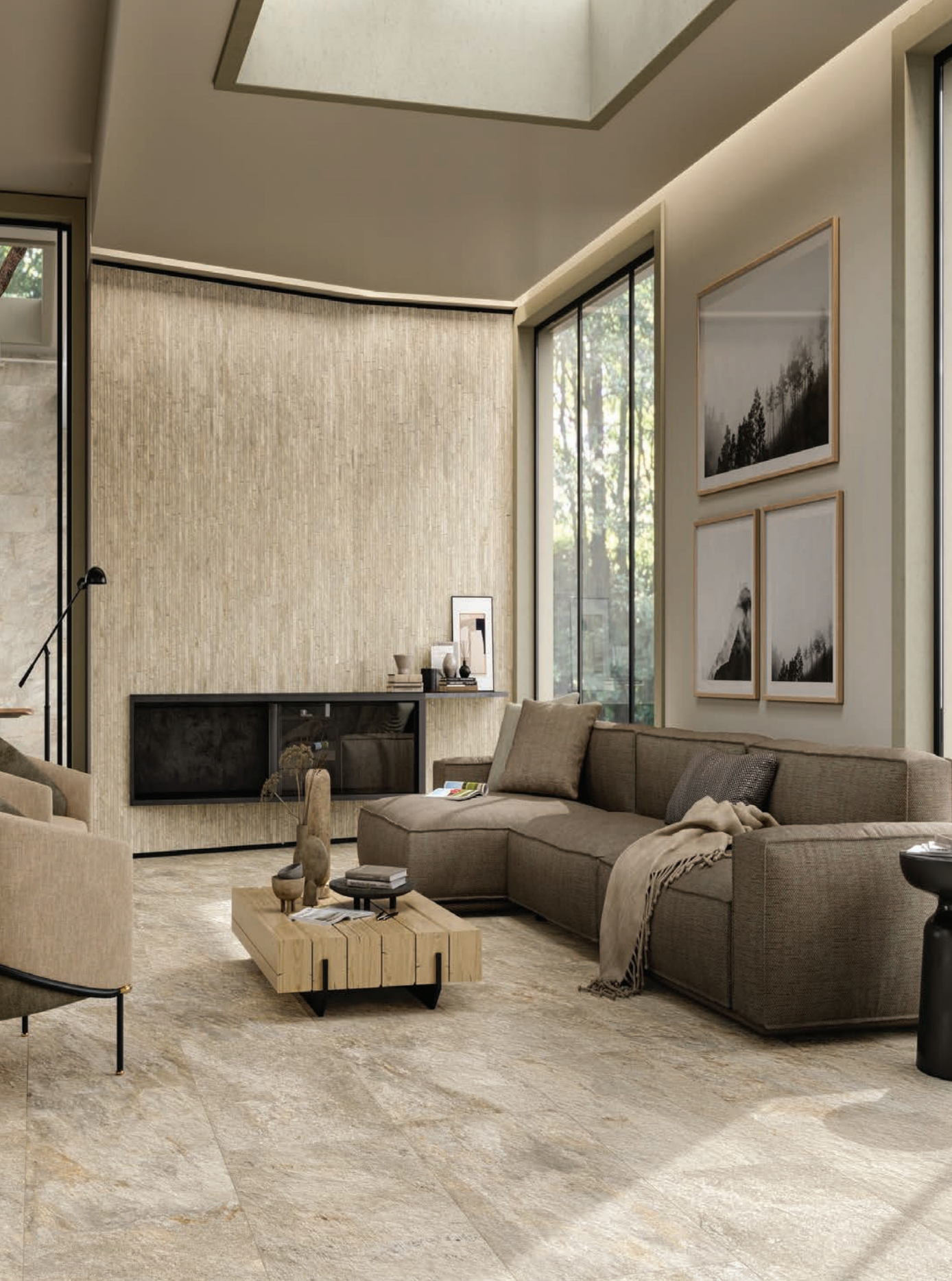
12" x 24" | 24" x 48" Field Tile in Magnesio Brick Mosaic in Magnesio