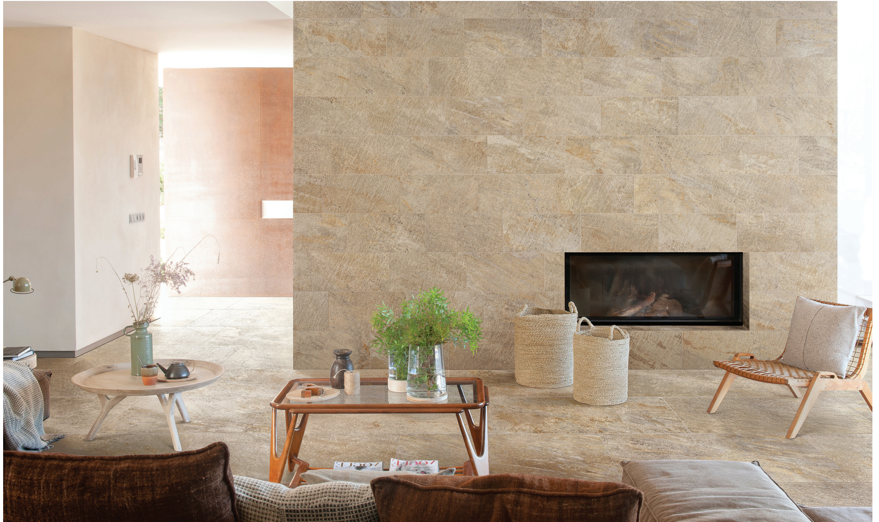
12" x 24" | 24" x 48" Field Tile in Oro