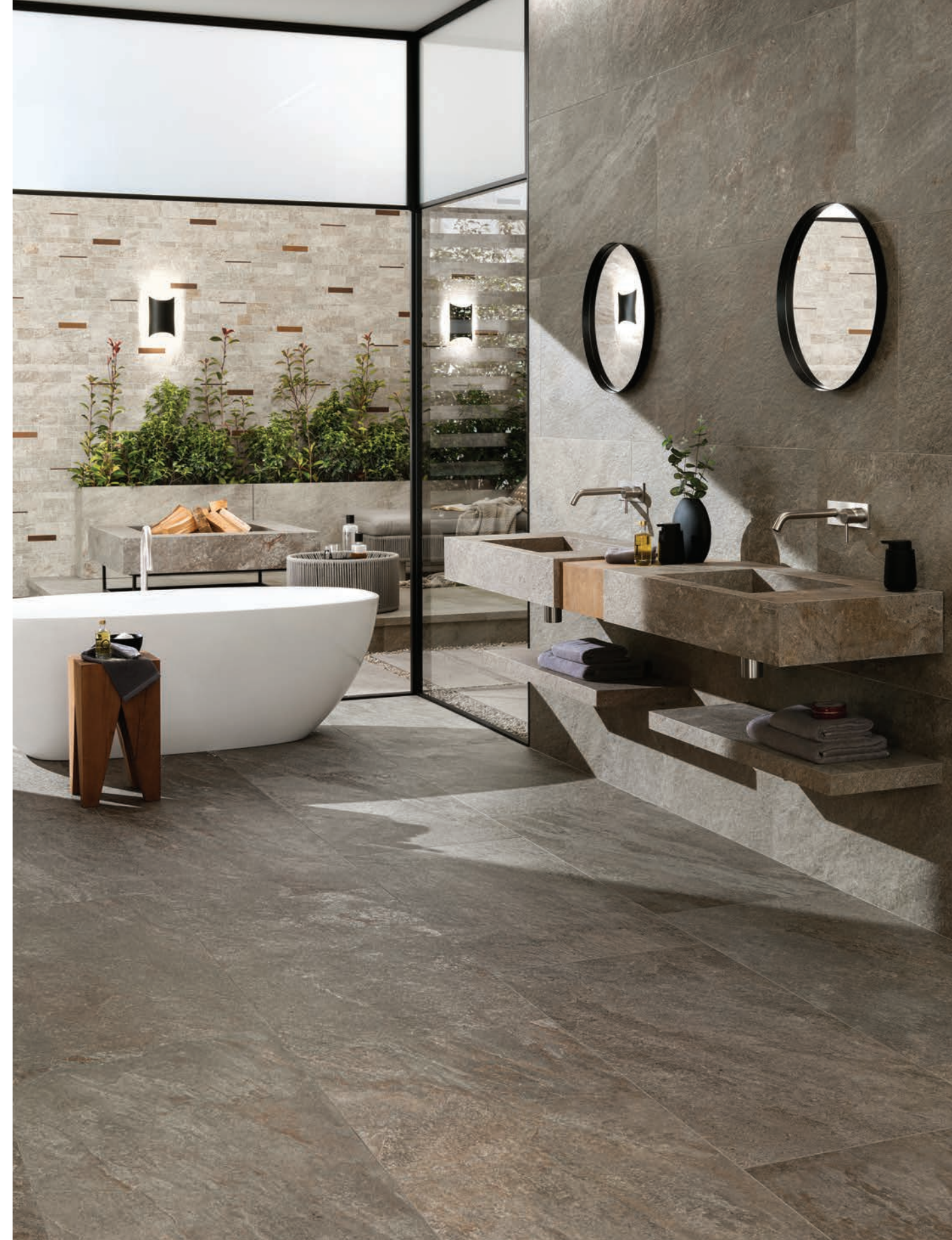
24" x 48" Field Tile in Piombo Corten Brick Mosaic in Magnesio