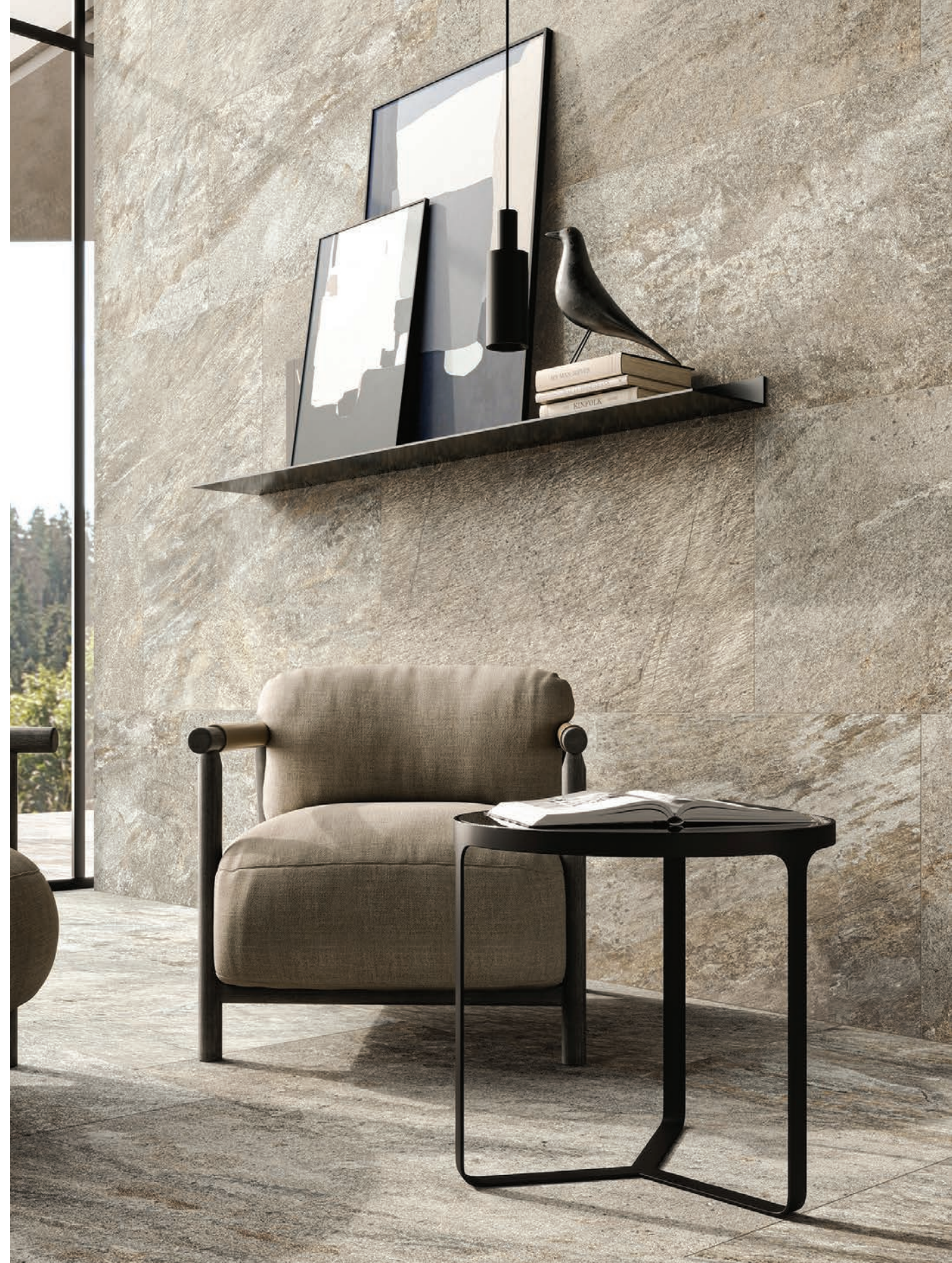
24" x 48" Field Tile in Platino