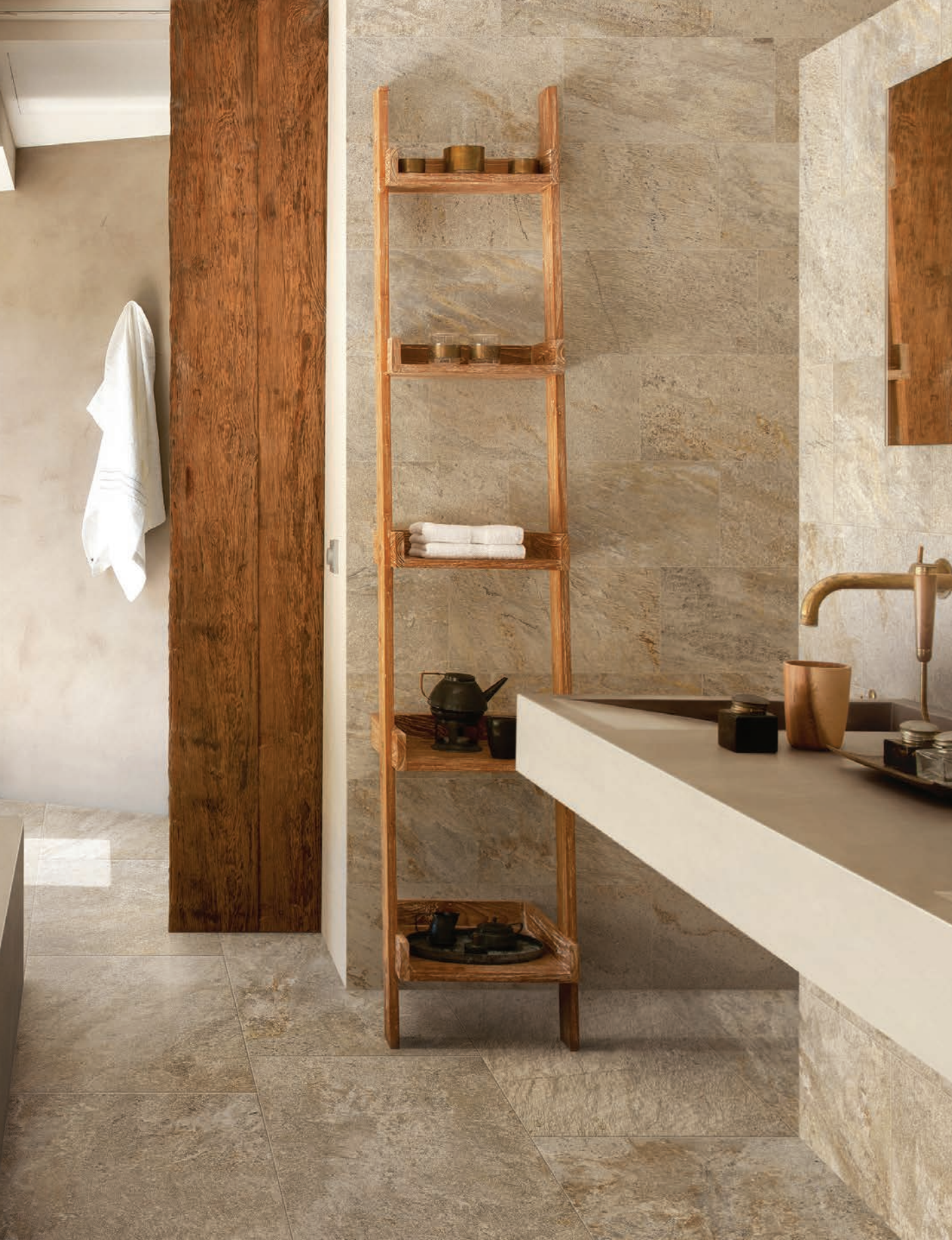
12" x 24" | 24" x 24" Field Tile in Oro