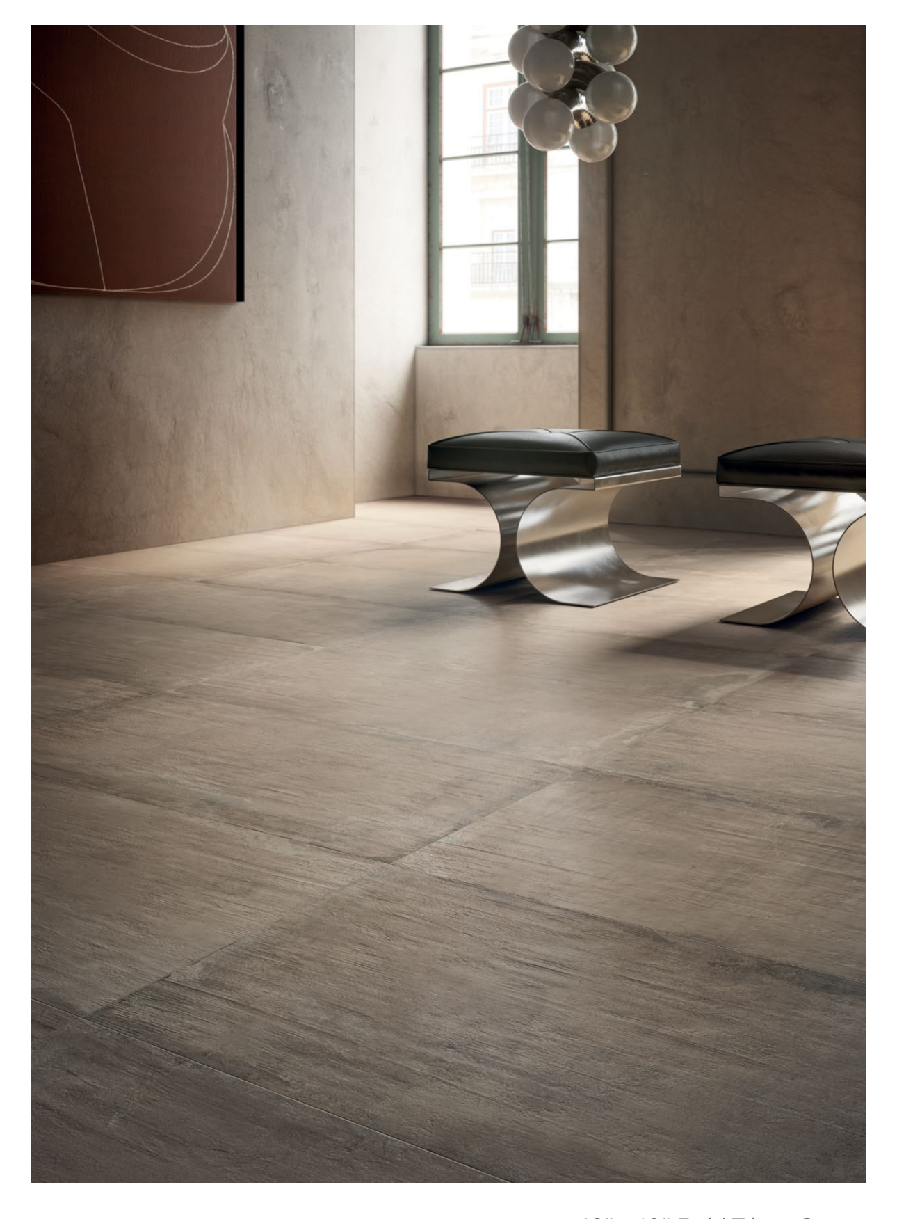
12" x 12" | 12" x 18" | 18" x 18" Field Tile in White