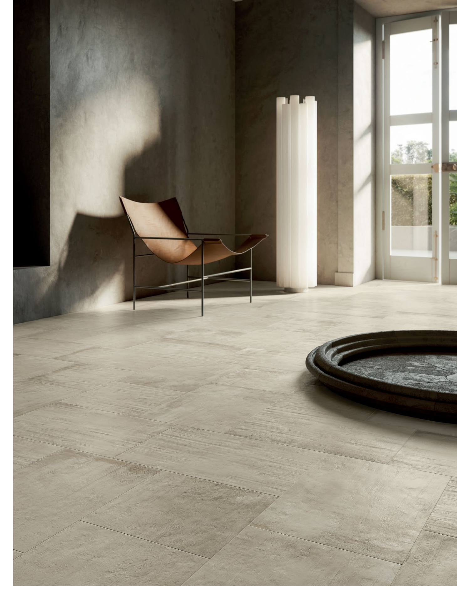
12" x 12" | 12" x 18" | 18" x 18" Field Tile in Beige