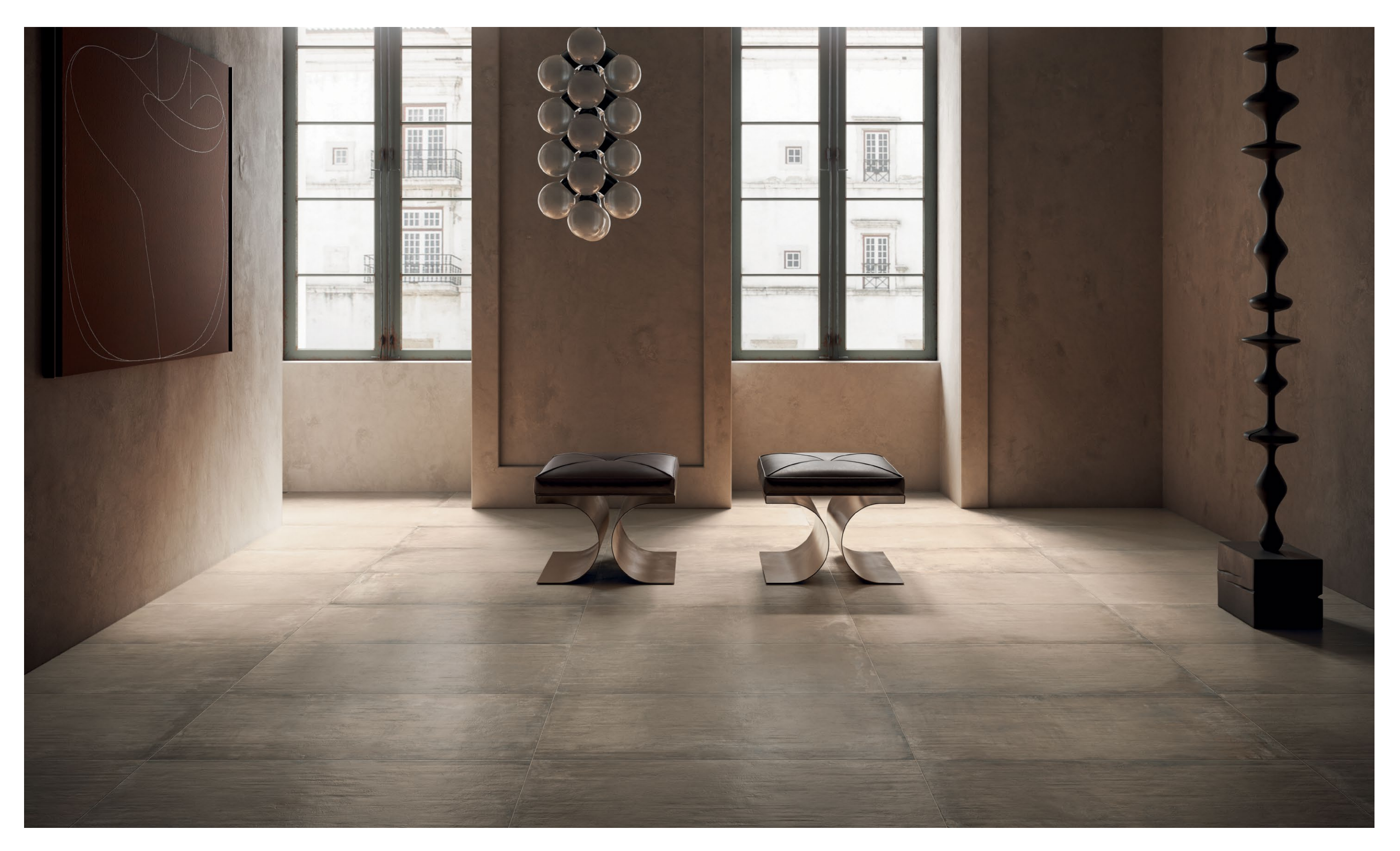
12" x 18" Field Tile in Greige