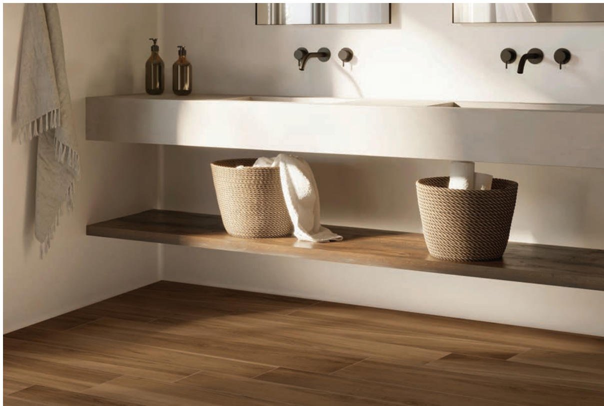
12" x 48" | 8" x 48" Field Tile in Noce