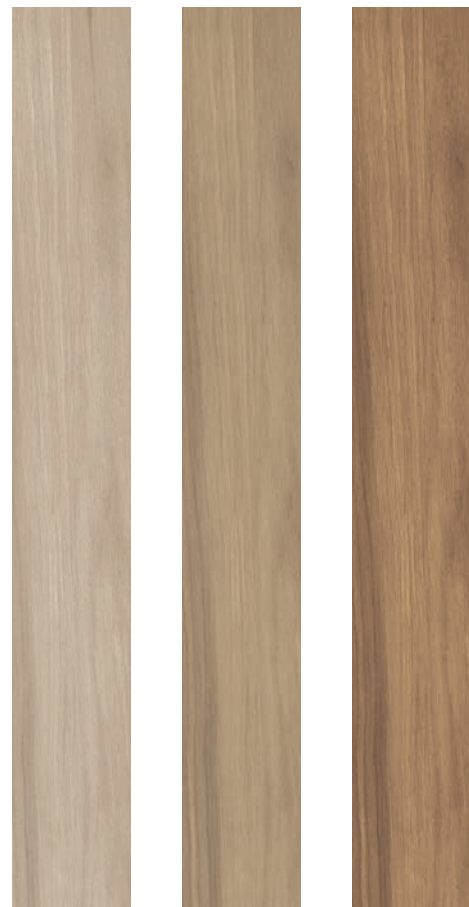
Rovere Acero Noce