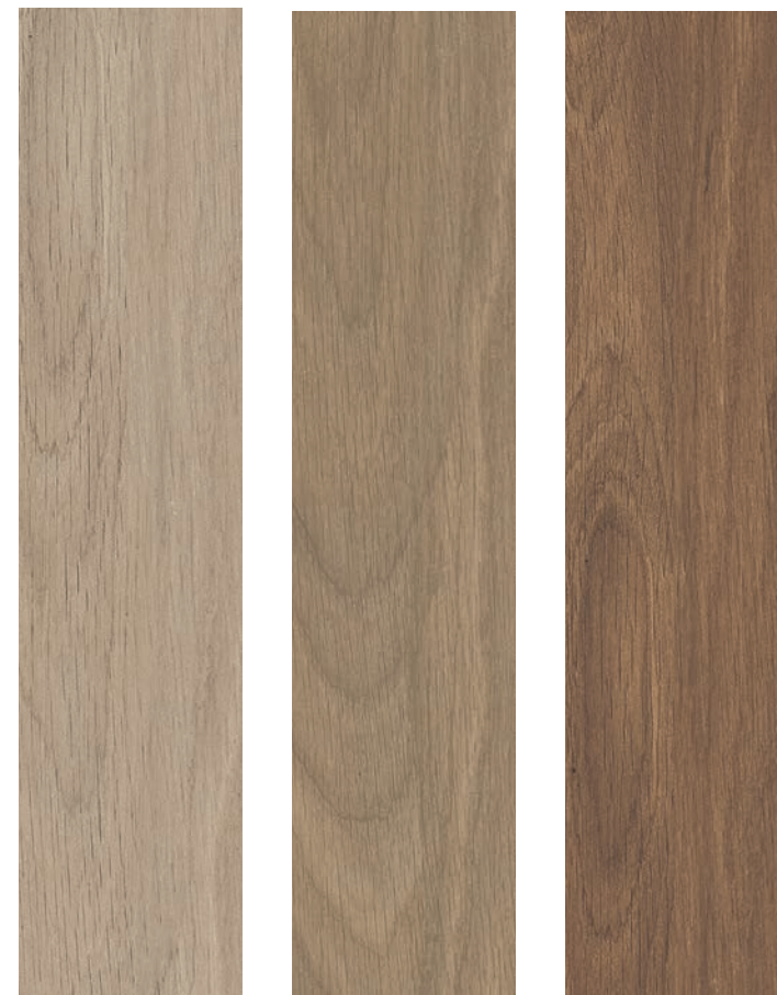
Rovere Acero Noce