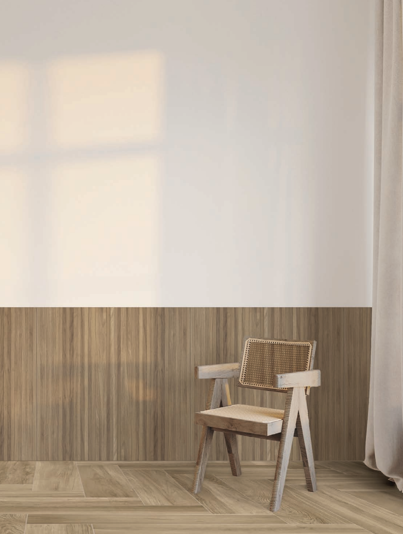
12" x 48" | 8" x 48" Field Tile in Acero 24" x 48" Field Deco in Acero