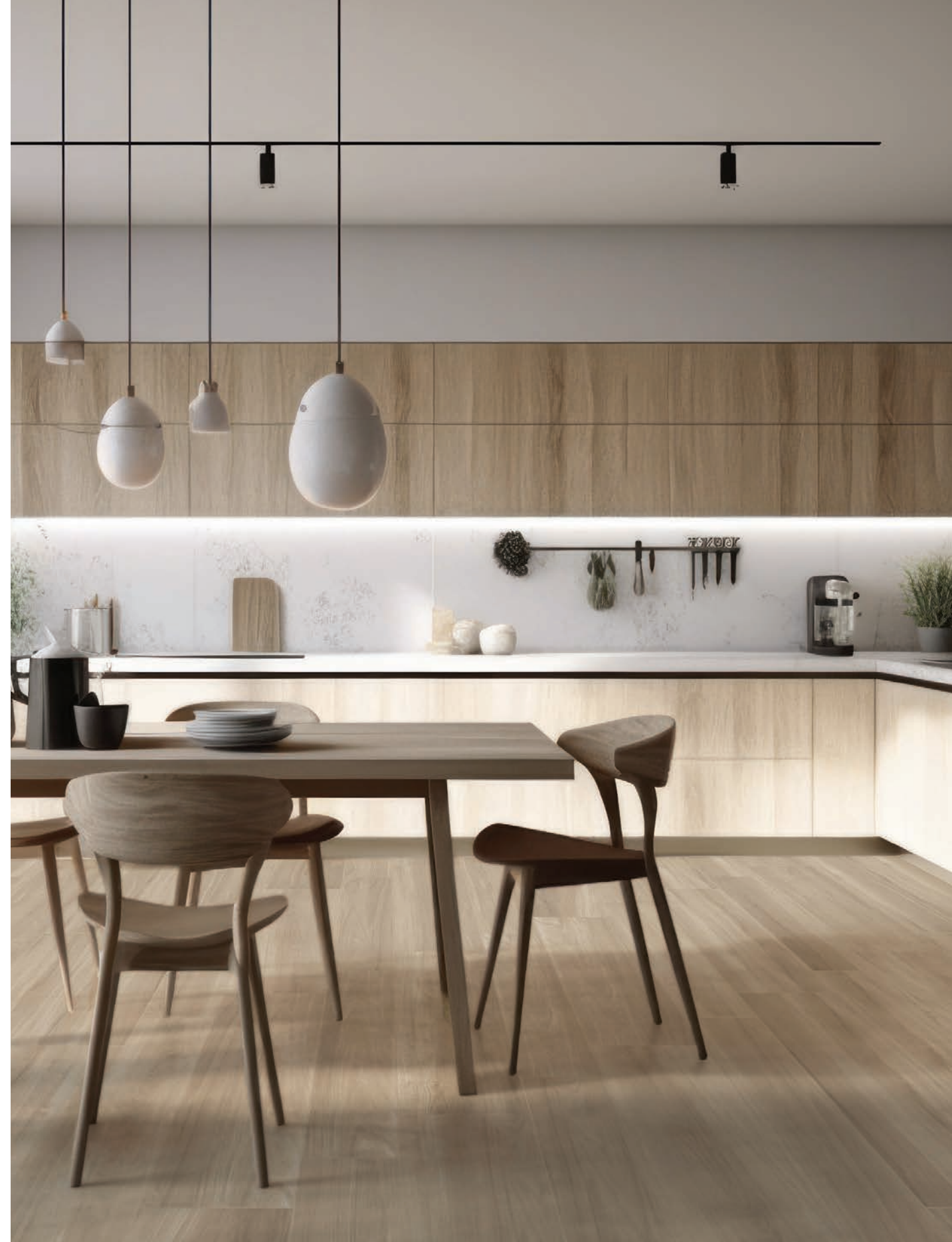
12" x 48" | 8" x 48" Field Tile in Rovere