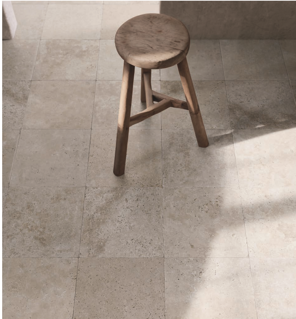
13"x13" Field Tile in Grey

Colors shown may vary from actual product. Final selection should be made from actual product samples.