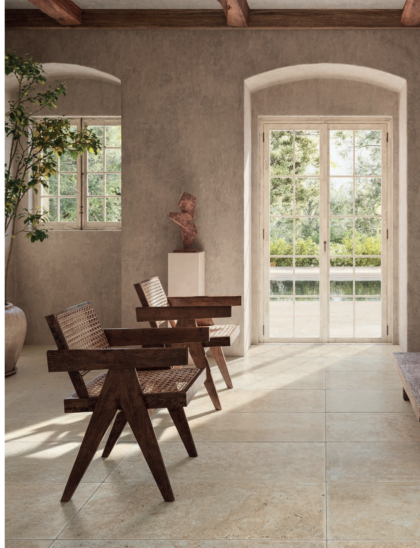
13"x20" Field Tile in Beige