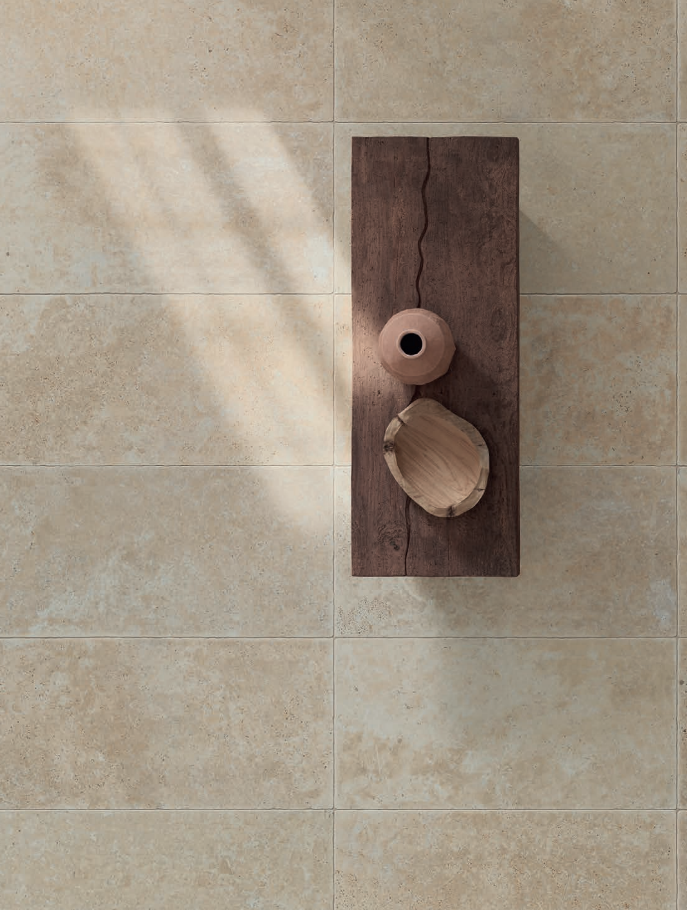
13"x20" Field Tile in Beige