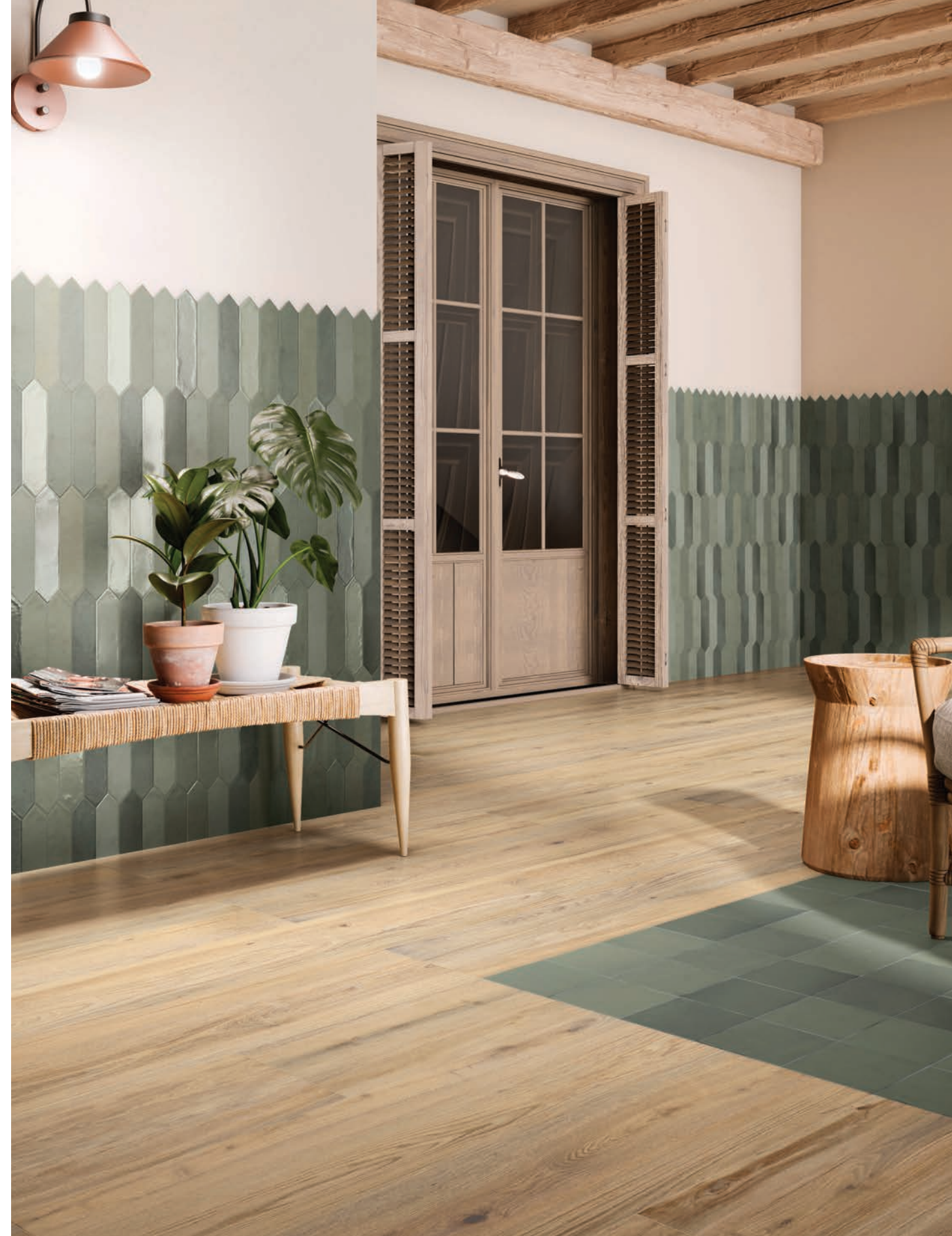
2.5" x 10" Picket in Forest