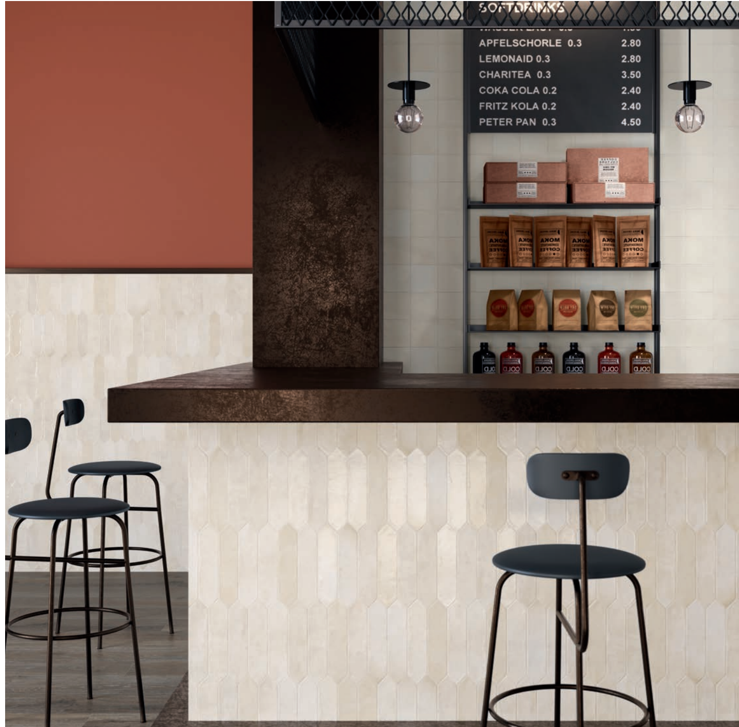
2.5"x 10" Picket in Coconut Milk