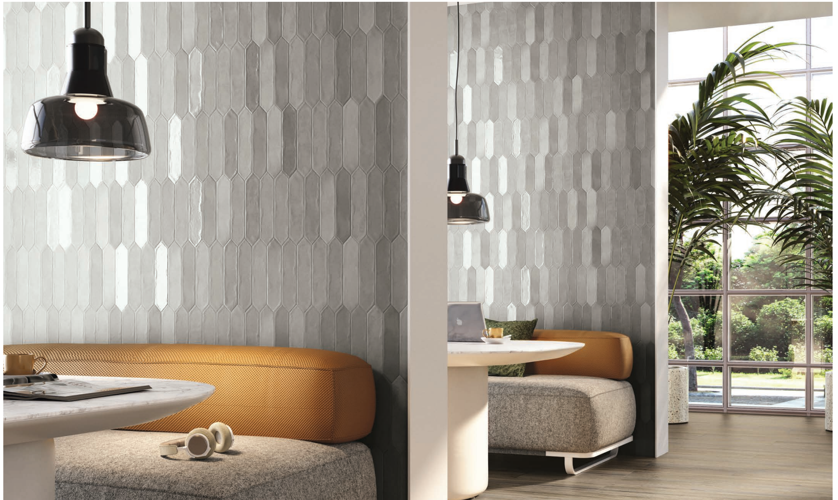
2.5" x 10" Picket in Mineral Grey