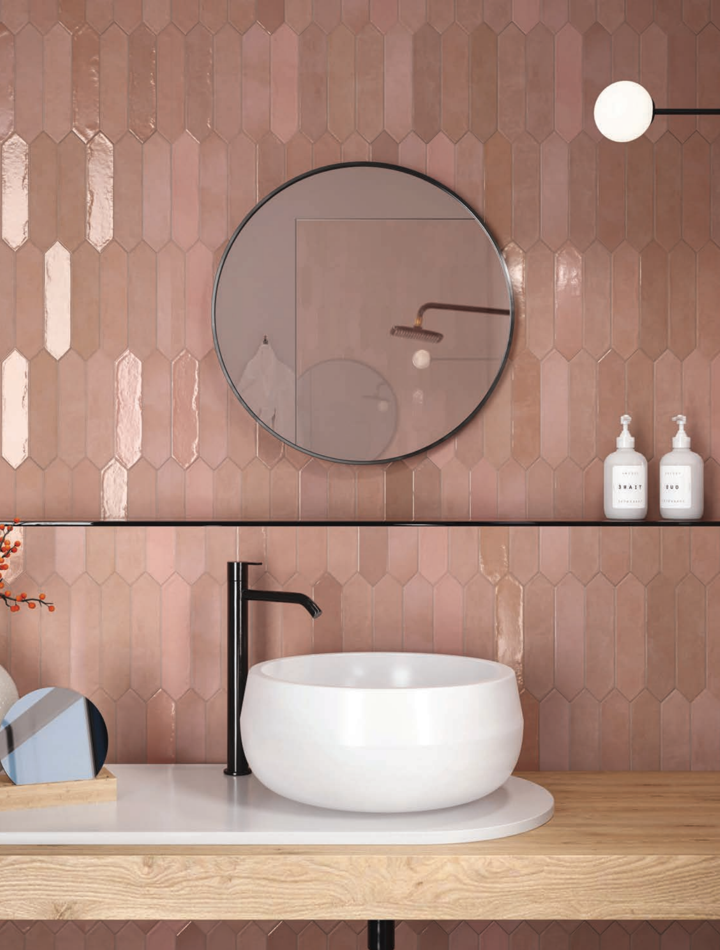
2.5" x 10" Picket in Ash Rose