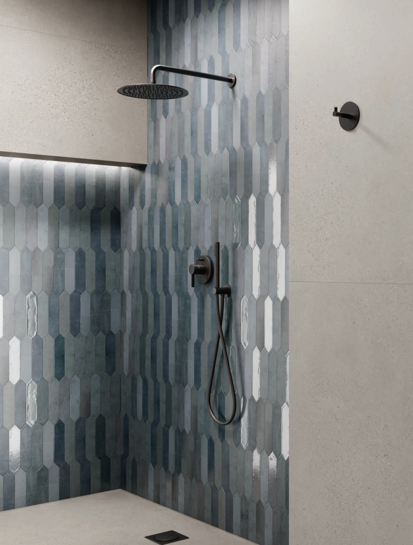
2.5" x 10" Picket in Blue Stone