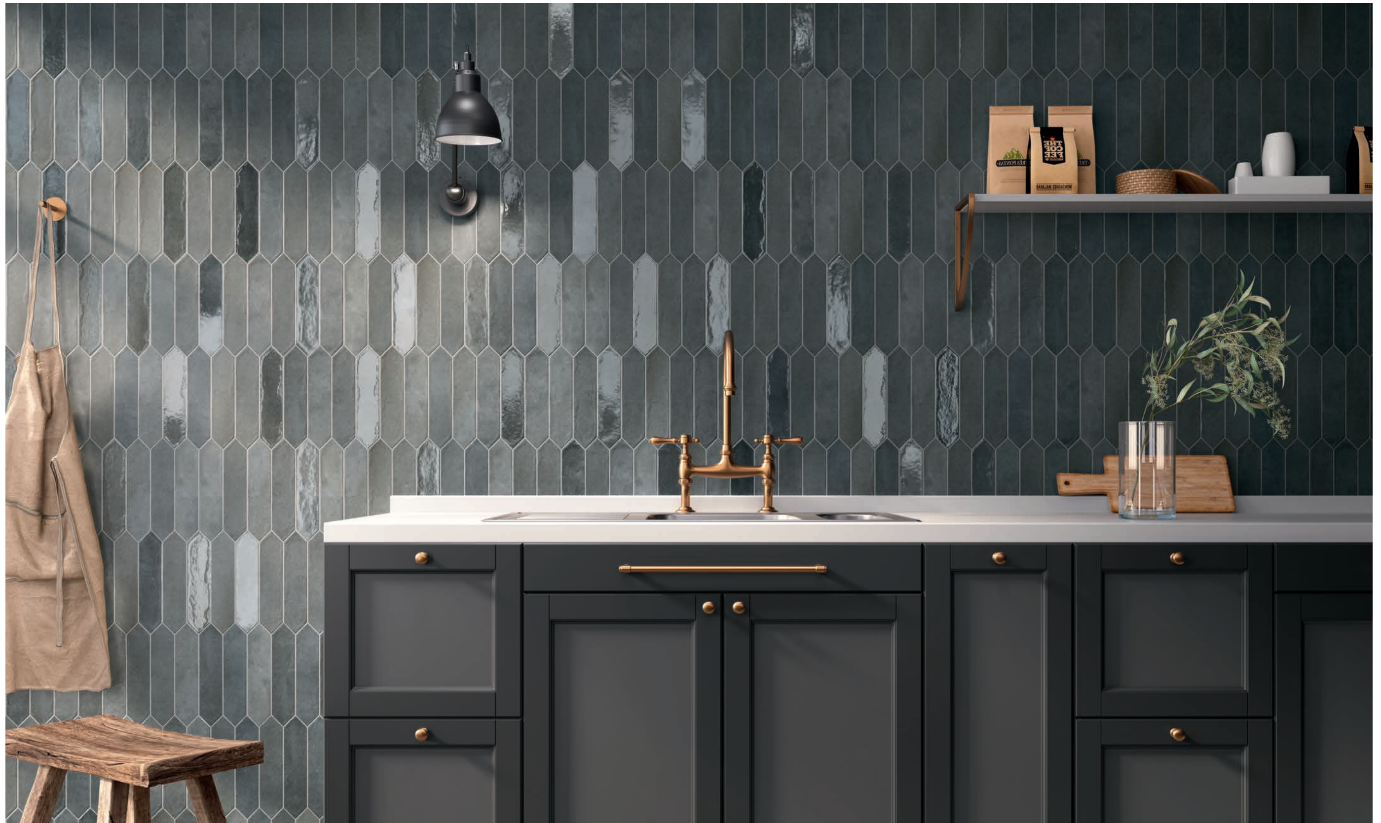
2.5" x 10" Picket in Obsidian