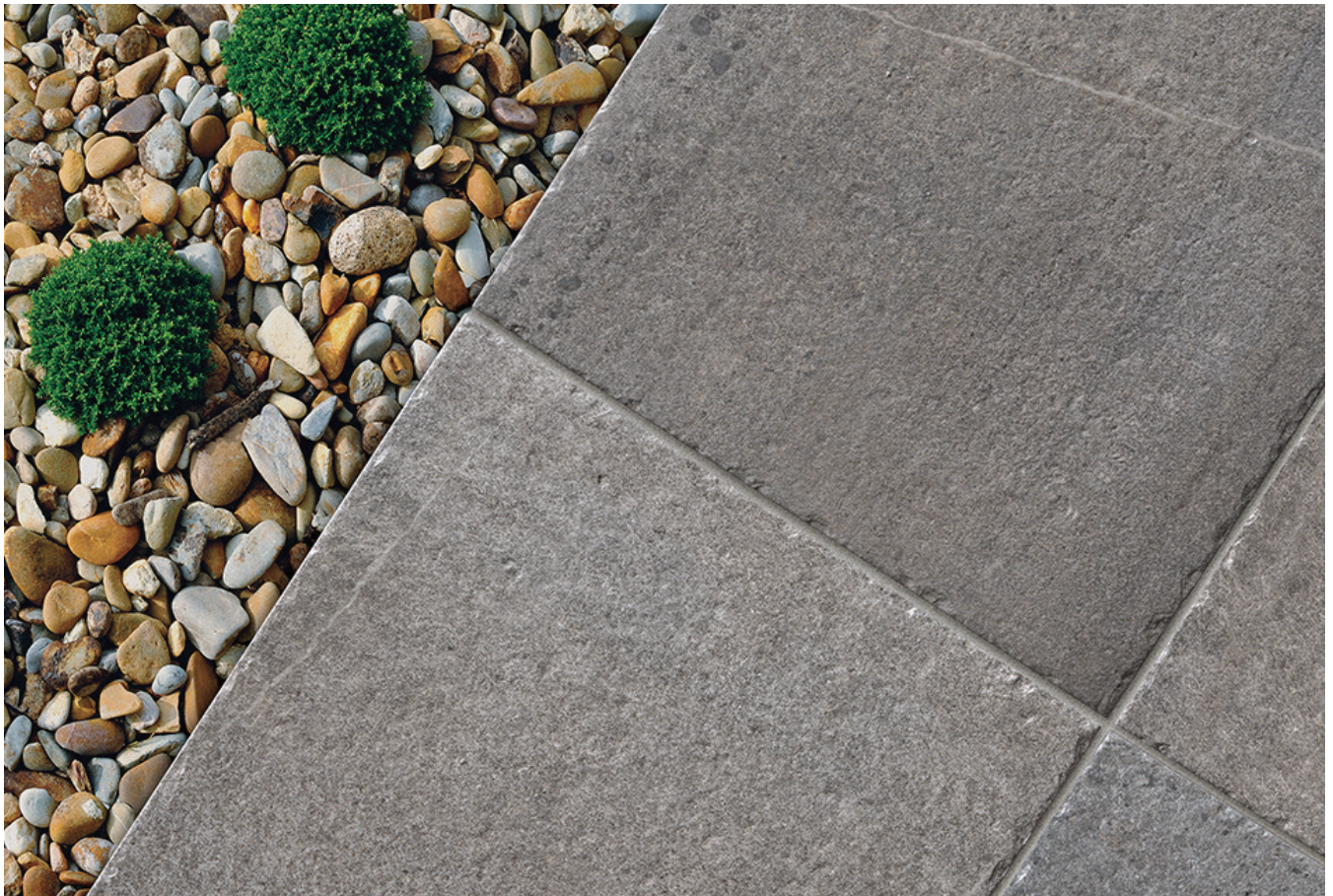
8"x8" Field Tile in Rosta Nuova