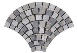
Due Maesta and Rosta Nuova Mix