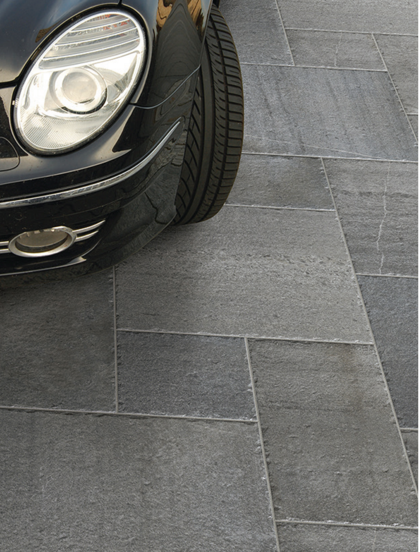
8"x8" | 8"x16" | 16"x16" Field Tile in Pieve