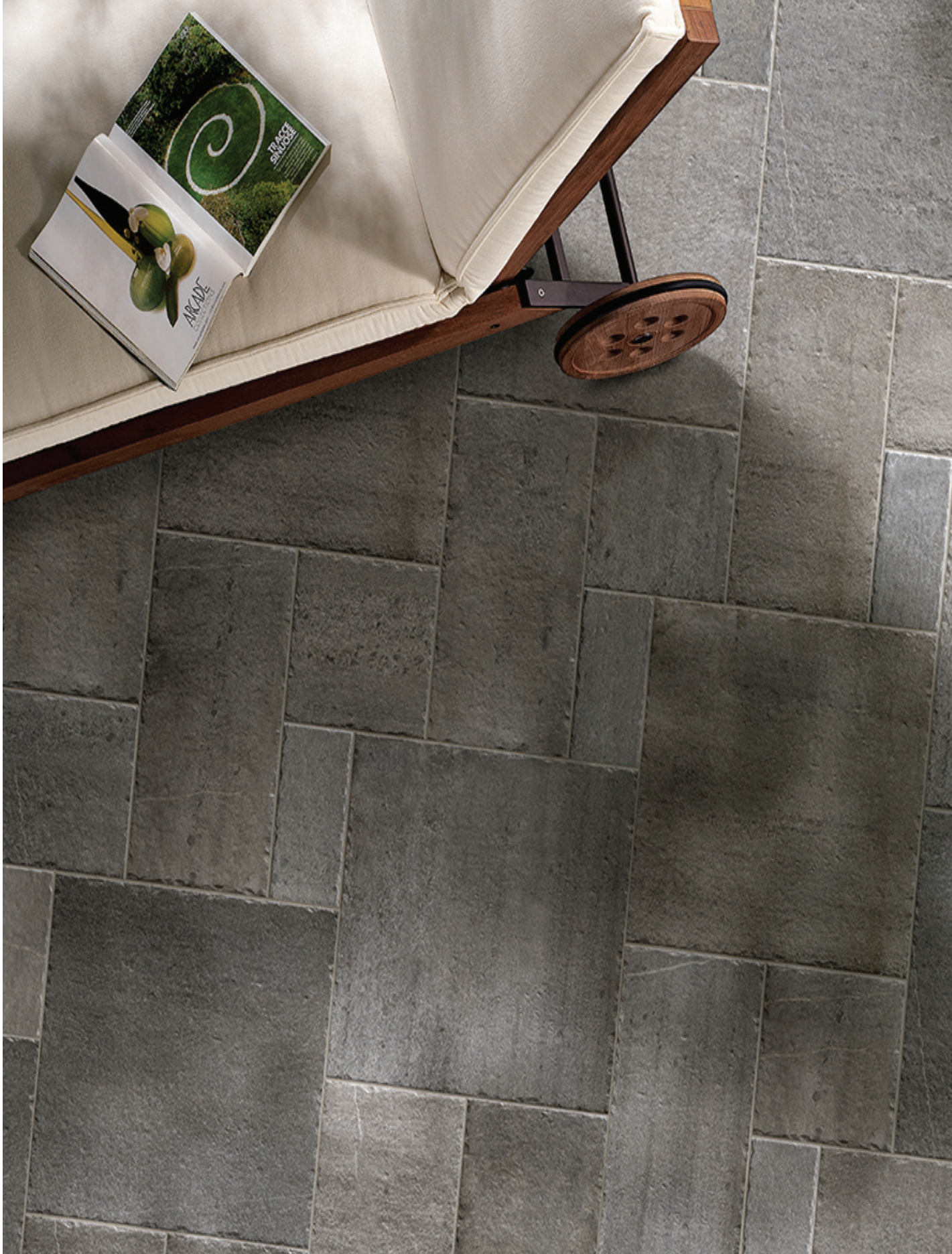
4"x8" | 8"x8" | 8"x16" | 16"x16" Field Tile in Rosta Nuova