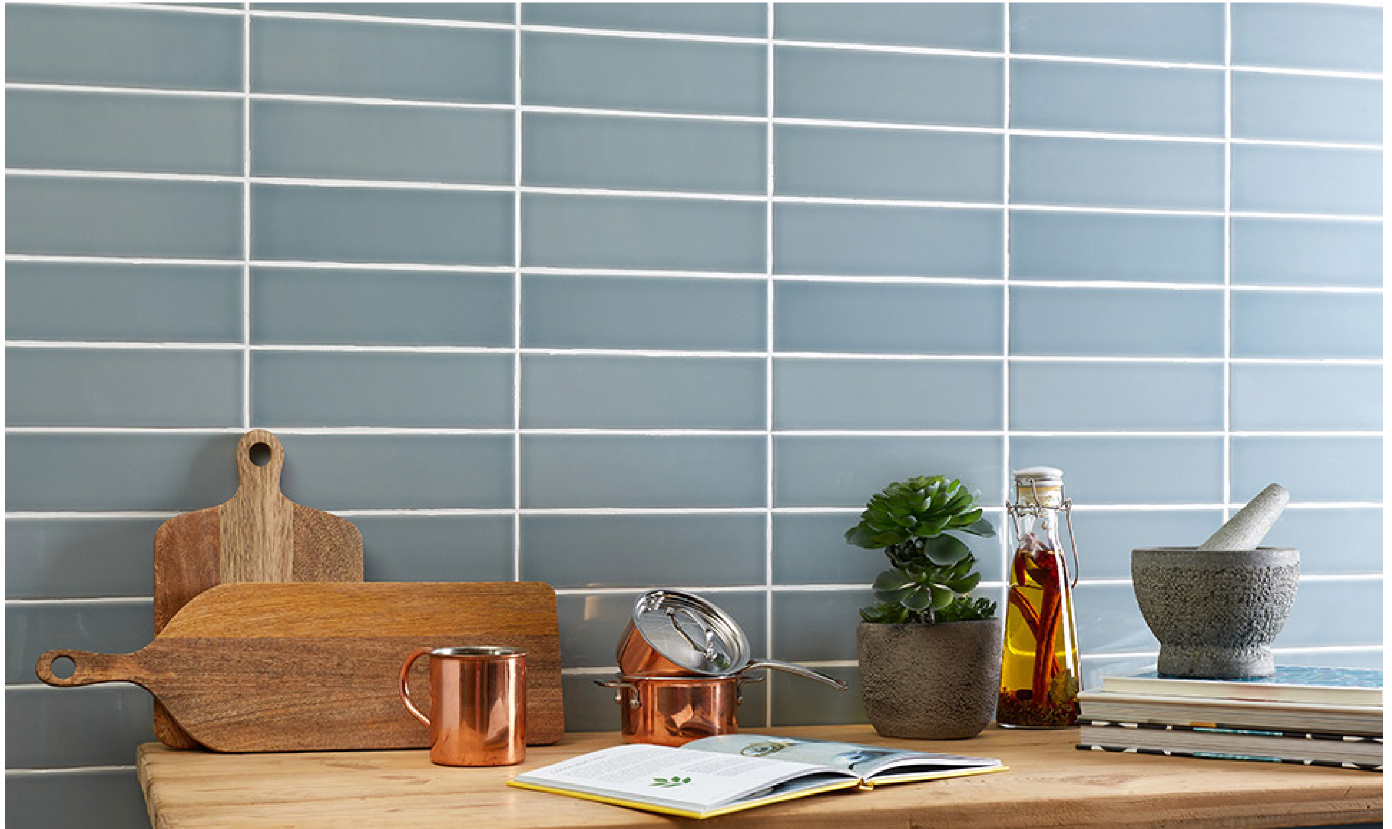
3"x9.5" Wall Tile in Pewter