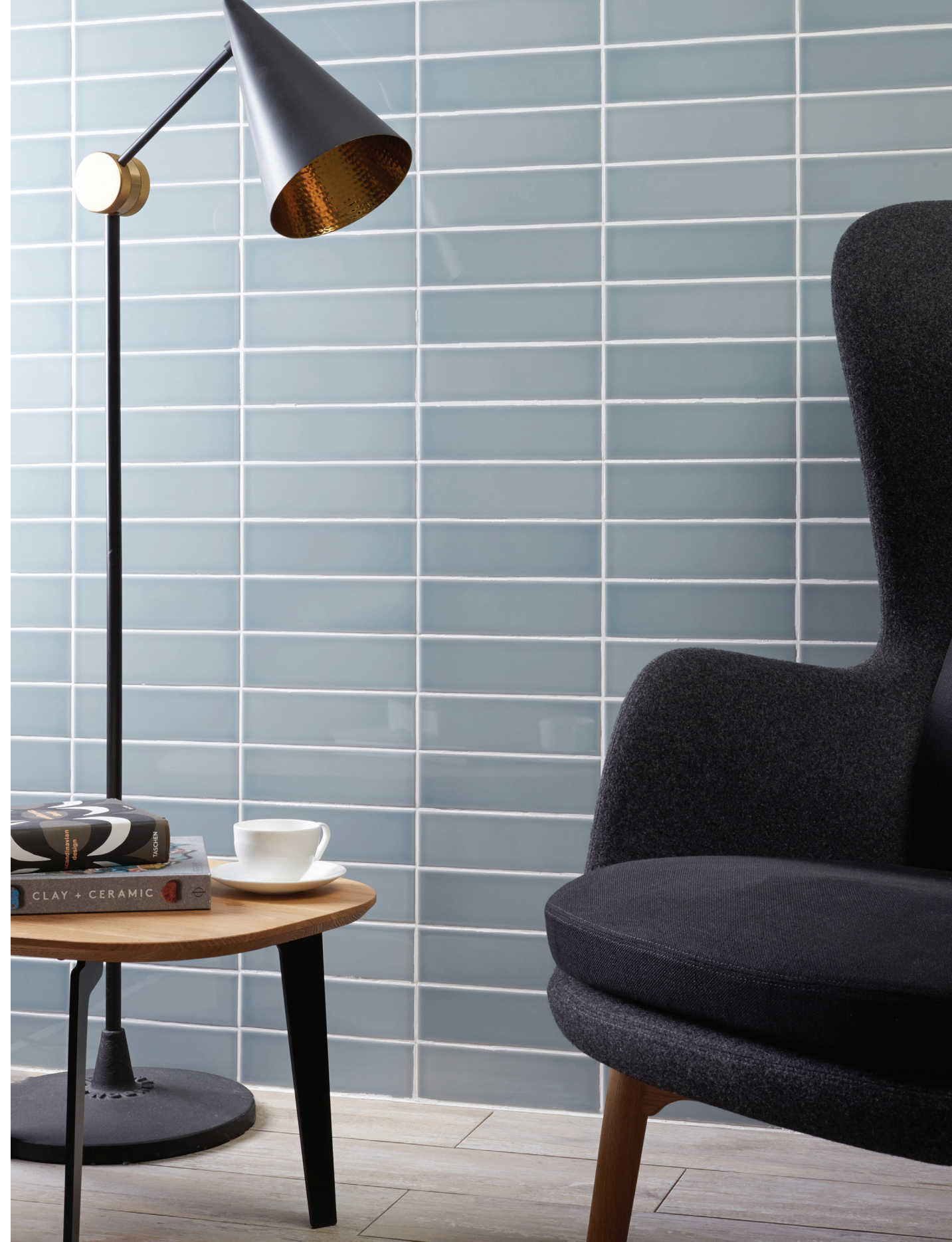
3"x9.5" Wall Tile in Pewter