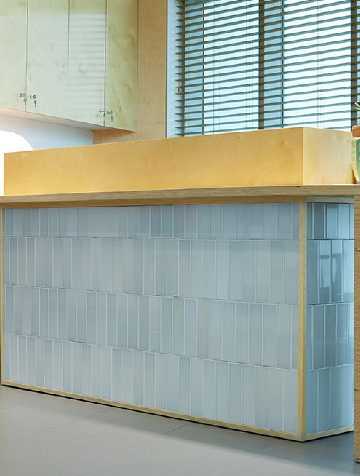
3"x9.5" Wall Tile in Pewter