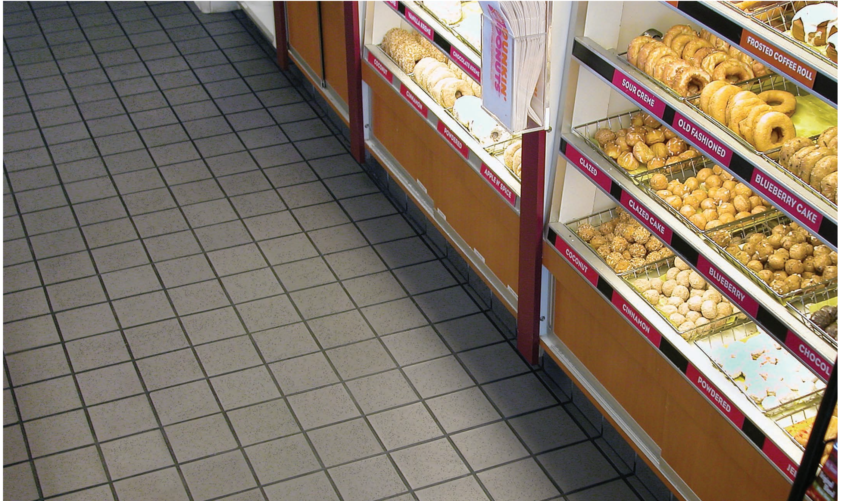
6" x 6" Field Tile in Puritan Gray