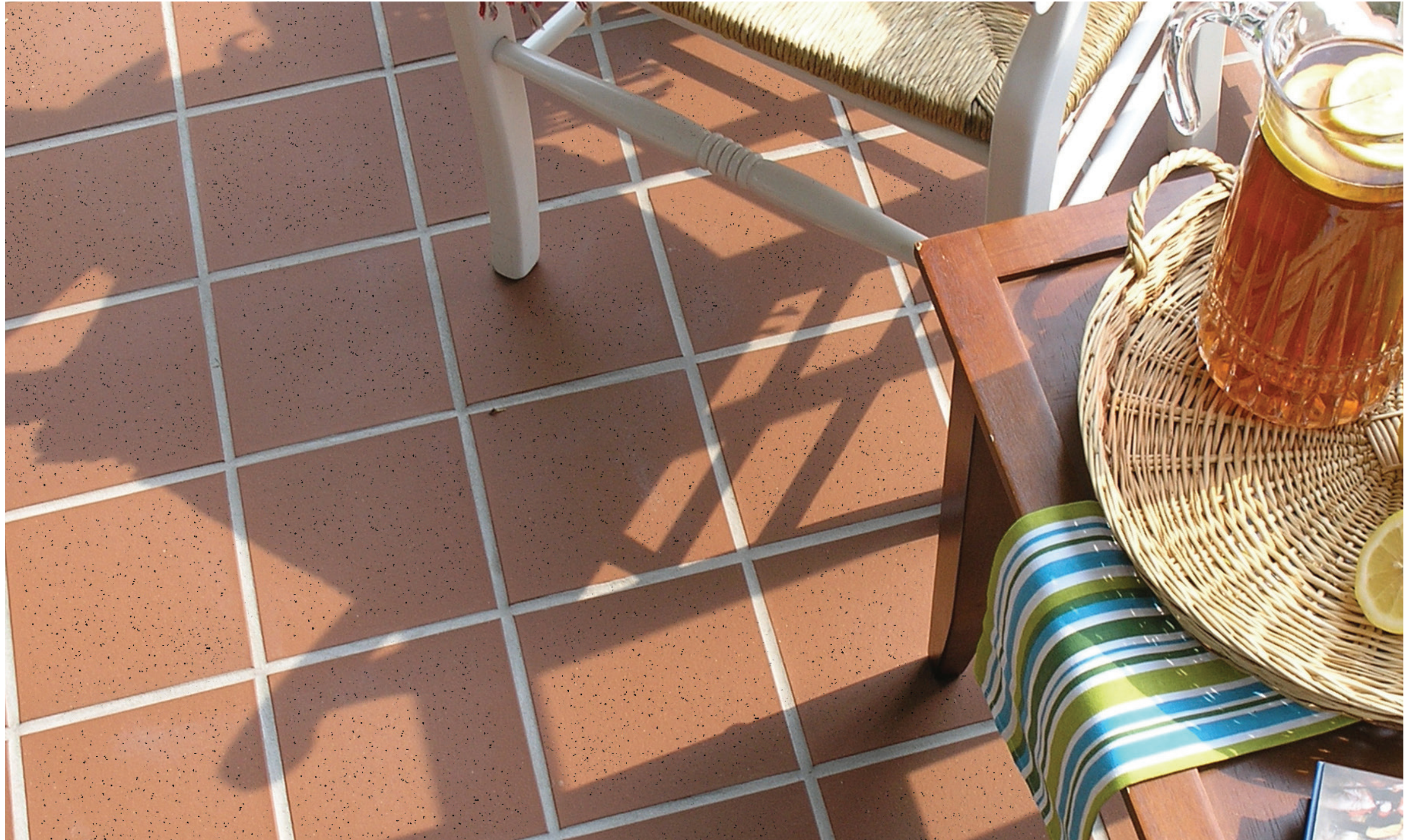
6" x 6" Field Tile in Mayflower Red