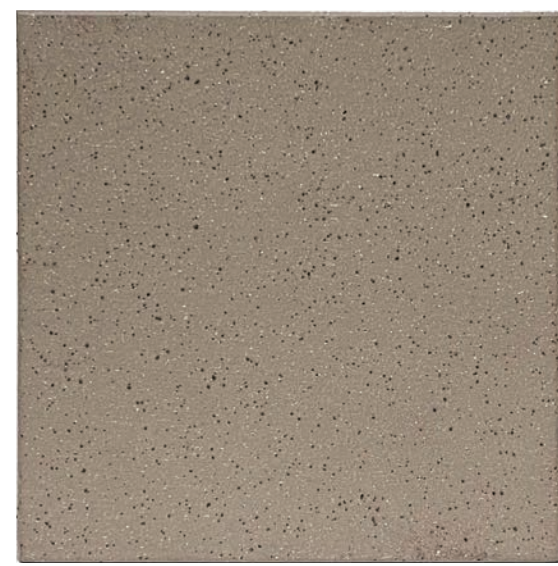
#571S Puritan Gray

Colors shown may vary from actual product. Final selection should be made from actual product samples. Products and availability are subject to change, please refer to our website for the most up to date selection.