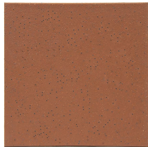
#311S Mayflower Red