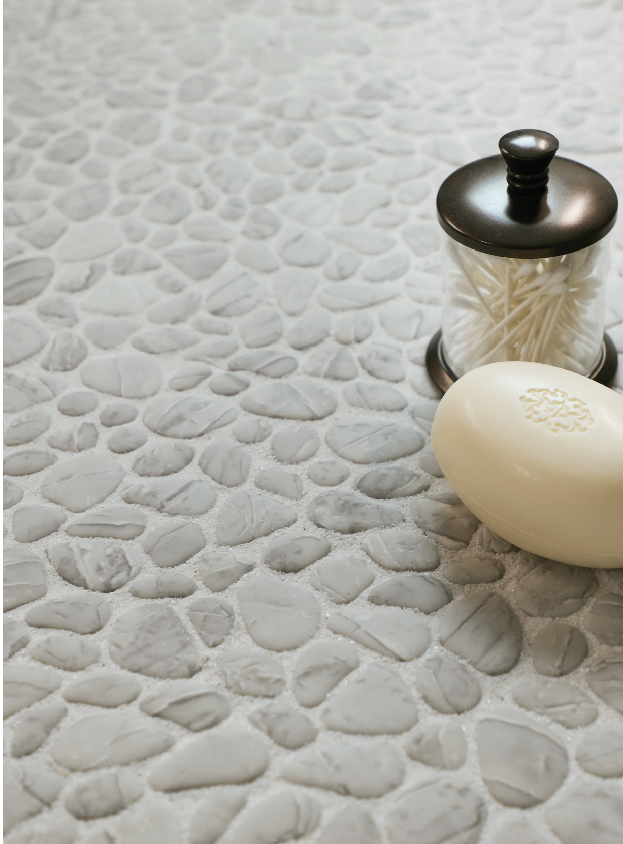
11.5"x11.5" Pebble Mosaic in Taupe