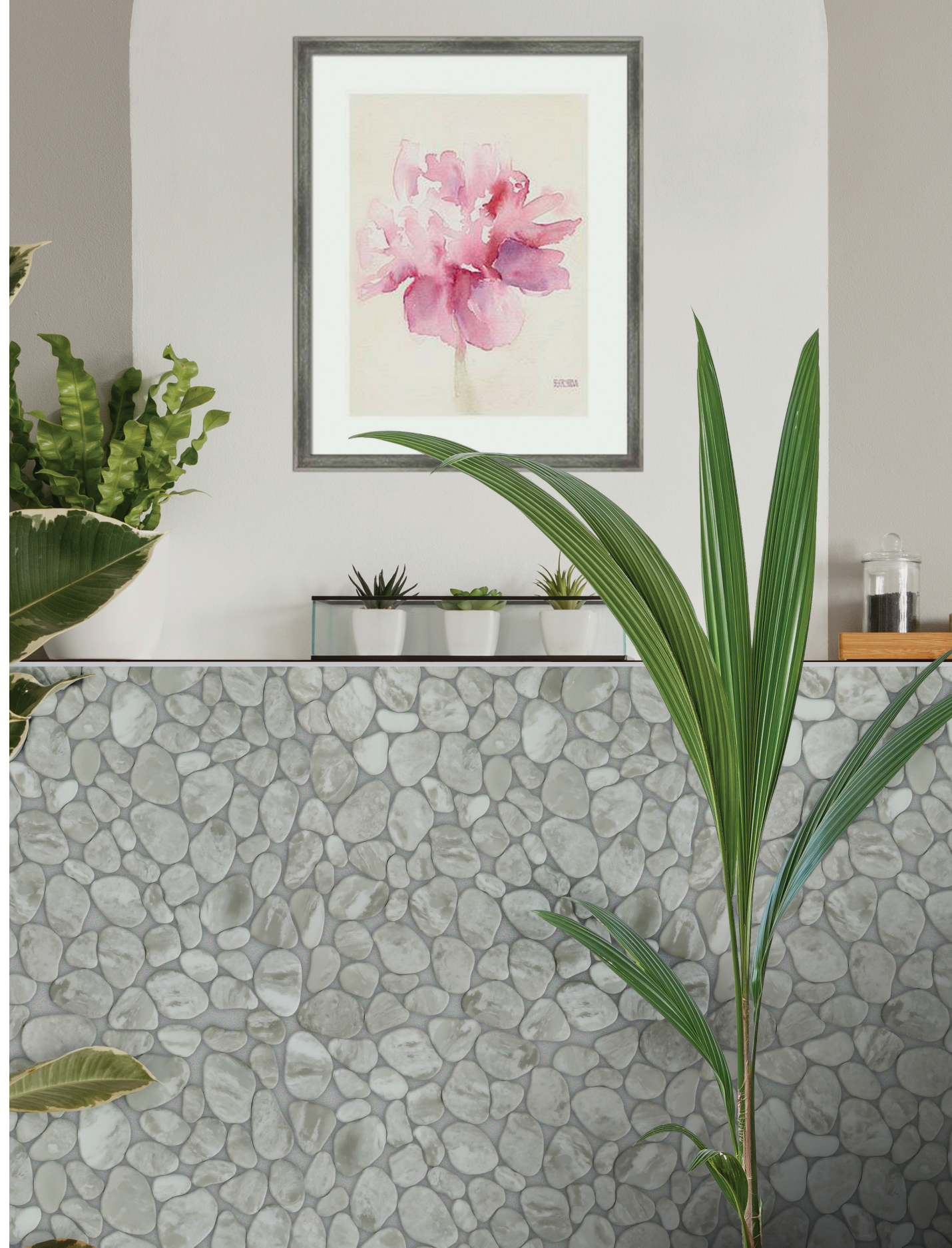
11.5"x11.5" Pebble Mosaic in Latte