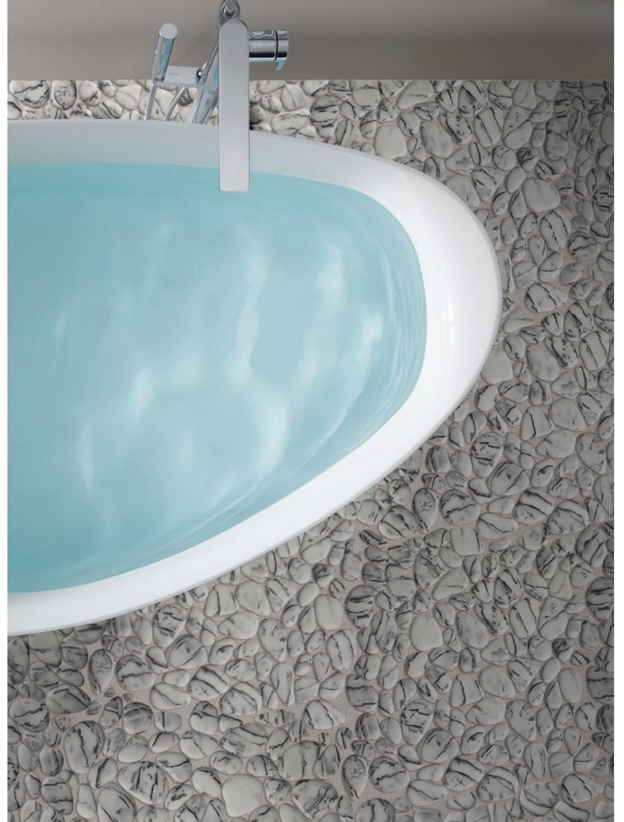
11.5"x11.5" Pebble Mosaic in Gray