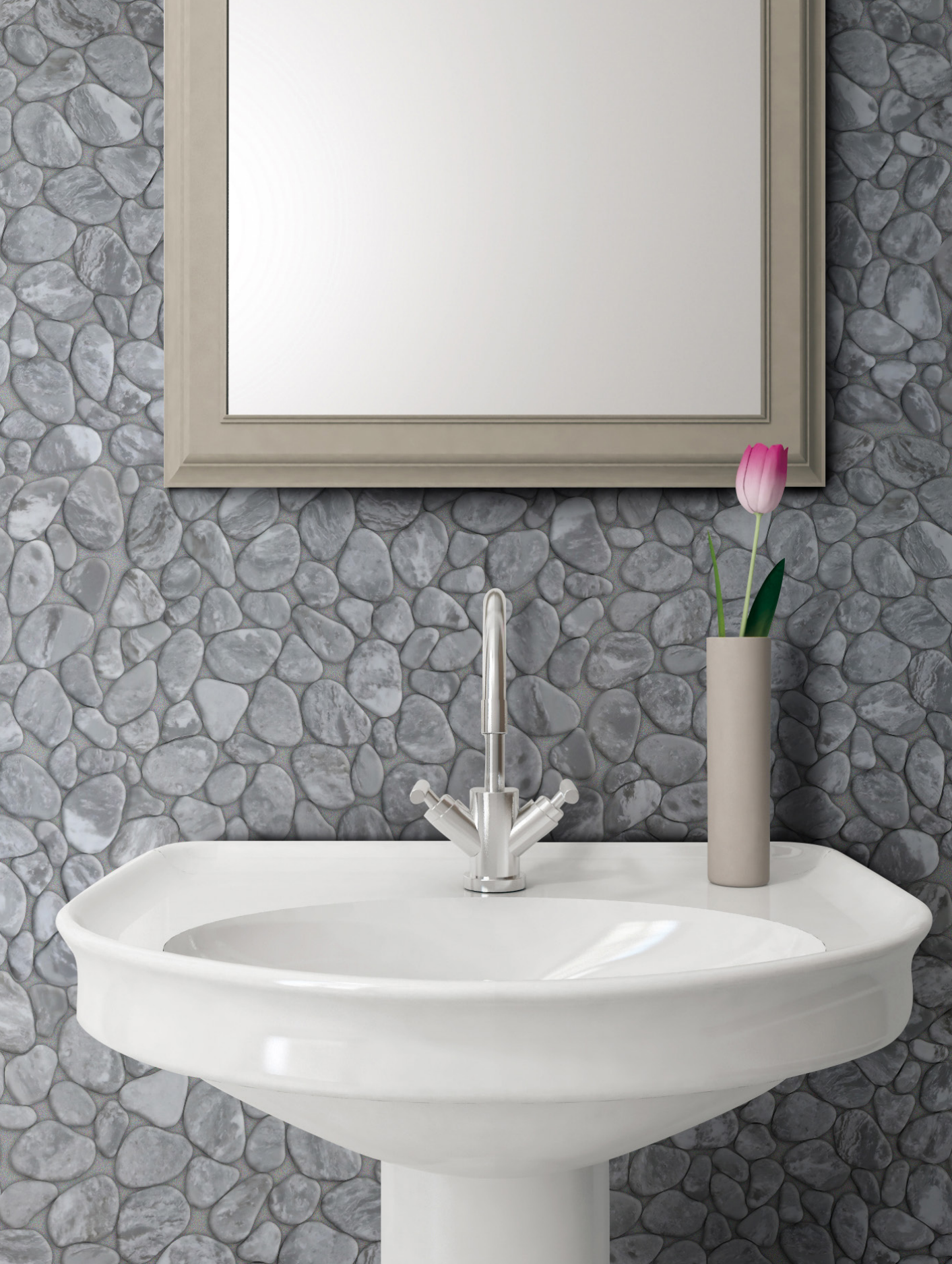
11.5"x11.5" Pebble Mosaic in Cloud