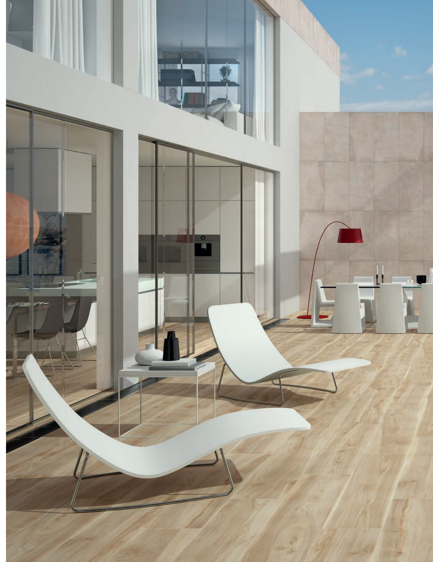
9"x47" Field Tile in Natural