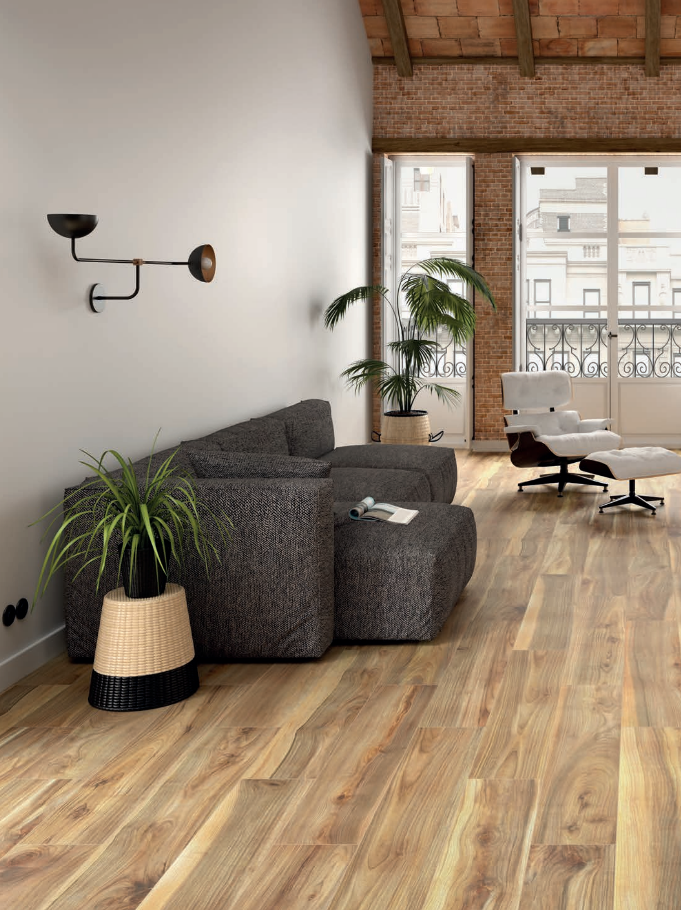
9"x47" Field Tile in Miel